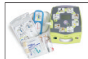
CPR-D•padz come complete with rescue essentials including a barrier mask, a razor, scissors, disposable gloves, and a towelette.

Infrequently used AEDs need electrodes that do not require frequent replacement. Most AED electrodes will expire before they are used. Corrosion of the electrode element due to long-term contact with ionic gel is the main limitation of electrode shelf life. ZOLL's CPR-D•padz protect the electrode elements with a novel design that sacrifices a non-critical element in the electrode to control the corrosion process and allow an unmatched five-year AED electrode life. ZOLL's CPR-D•padz reduce electrode replacement costs, facilitates AED readiness and maintenance, and decrease the probability of an AED's failure due to electrode expiration.