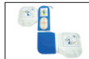
CPR-D•padz offer clear anatomical placement illustrations and a CPR hand positioning landmark.

Simplifying electrode placement is critical to widespread use of AEDs. Labeling helps but is often overlooked or discarded in an emergency that is sudden and unanticipated. The infrequent rescuer is easily confused when looking at a victim as to "left," "right," "up," and "down." Two separate electrodes cause concern over incorrect placement and technical complications if electrodes stick together before being placed correctly on the patient. The unique one-piece design of ZOLL's CPR-D•padz addresses these problems by orienting the design to the head while using the easily remembered CPR landmark (the sternum) as the key placement cue. The backing of the electrode is then removed by a simple pull after positioning. Because this is the same placement taught for CPR hand position, AED users benefit from having to remember only one easy landmark for both interventions.